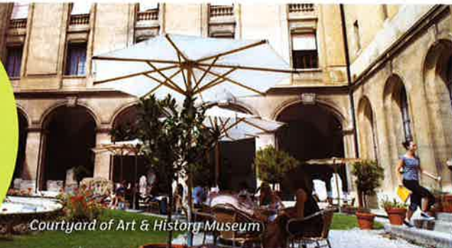
Courtyard of Art & History Museum